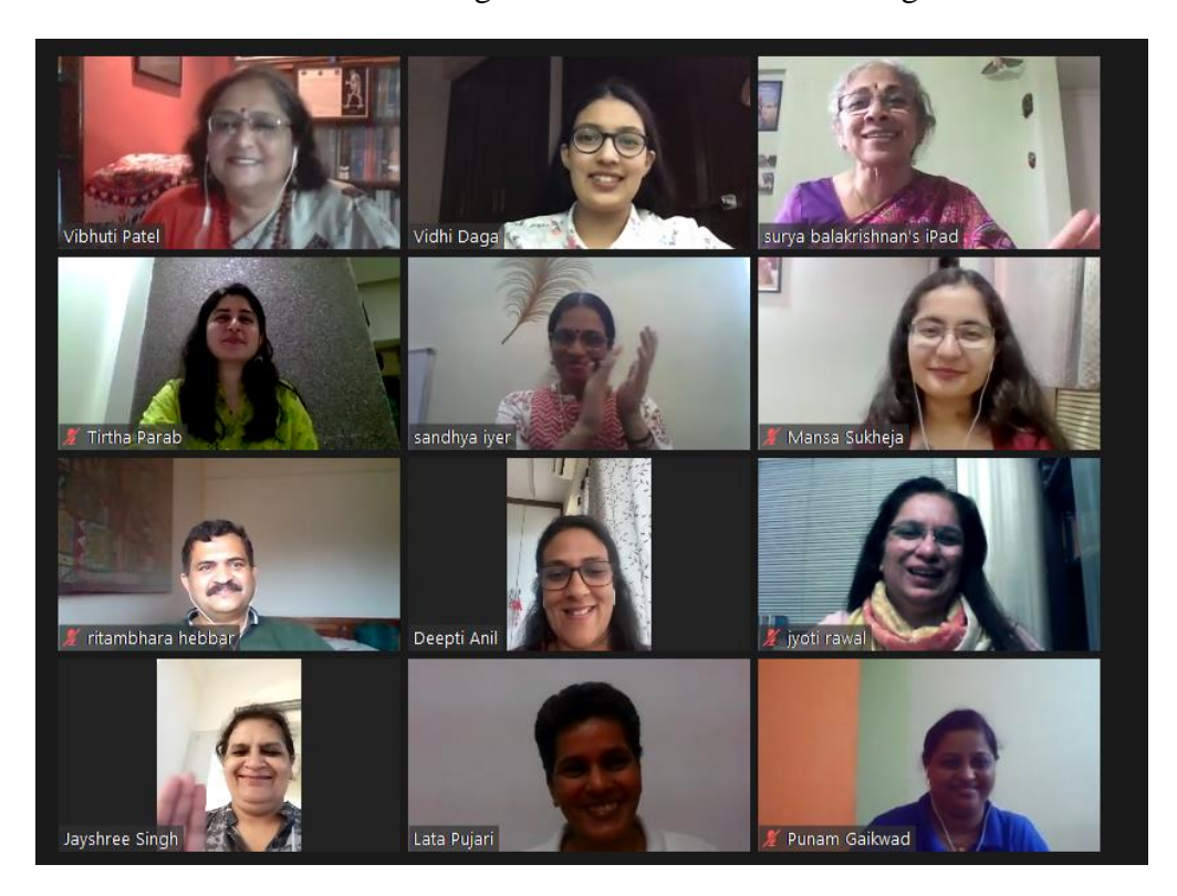
2. FES Genderlogue Students Event 18th August 2020